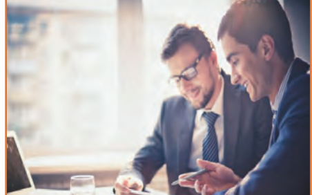
Fig.7.5.1: Social interaction