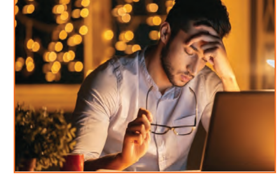
Fig.7.4.10: Stress Management

If your heart beats faster and you breathe quickly, tension in your shoulder or clinching your fists beware your body may be showing sign of anger, take steps to calm yourself down. Once you will be able to recognize the signs of anger you can calm yourself down.