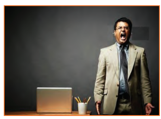
Fig.7.4.11: Anger Management