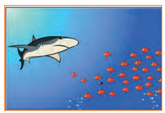
Fig.7.4.8(a): Small Fishes and Big Fish

Once there was a shoal of tiny red fish living in the sea. One among them was a little different. His name was Swimmy and he was black in colour. Swimmy was the fastest swimmer in the shoal. The fish would swim around in the sea looking for food. One day when they were busy searching for lunch, Swimmy who was far ahead of the others saw a big fish coming in their direction. The big fish was also looking for his lunch---smaller fish. Swimmy was scared! If the big fish would spot his shoal, all of them would be eaten up. Swimmy thought hard of a way out and quickly came up with a plan. He quickly swam back to his shoal and told all the fish about the big fish and also explained his plan to escape from being eaten.